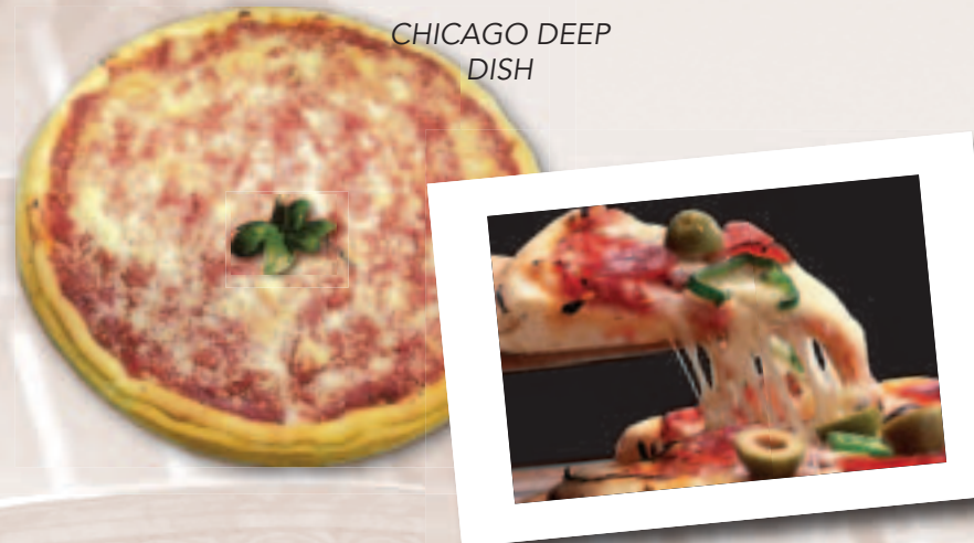
CHICAGO DEEP DISH